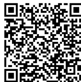
HEE Newly Qualified Pharmacist pathway webpage

The pathway is also intended to help pharmacists make the transition to more independent, self-directed learning. It acts as a stepping-stone towards enhanced and advanced practice.